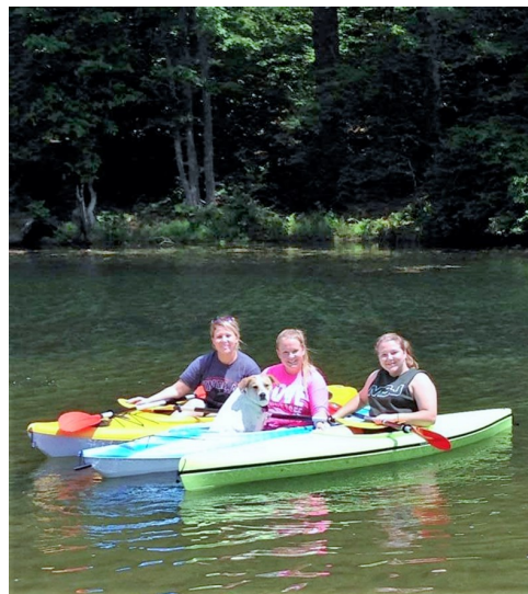
Lake Bomoseen, VT with college friends

What I most enjoy about exploring local waters by kayak is the opportunity to experience NW Ohio from a different perspective! I've become accustomed to seeing familiar places mostly from the road, so seeing the landscape from the water has been an exciting new way to explore the area I've lived in my whole life. In the short time since purchasing my first kayak in 2019, I've enjoyed paddling the Portage River, Maumee Bay State Park, Howard Marsh, the Maumee River, Lake Erie, and the clear-watered quarries in Gibsonburg.