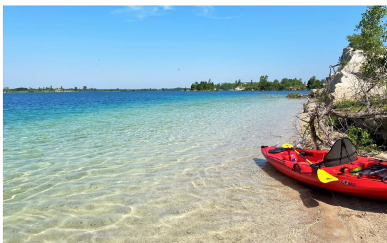
Eagle Lake in Gibsonburg, OH

Of the countless places I've kayaked locally and away from home, my favorite spot is the Crystal River in Glen Arbor, MI. Although the river isn't very deep, the water is so clear that you can see every pebble, fish, otter, and turtle below as the river winds through the pines and birch trees. The “icing on the cake” is after you finish paddling the 6.3 miles, you won't be far from some great breweries and wineries along M-22! With plenty of rental liveries in the area, I would definitely recommend checking it out if