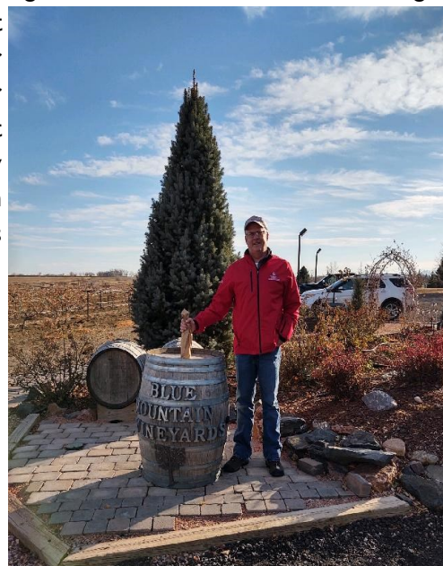
Blue Mountain Vineyards in Berthoud, Colorado