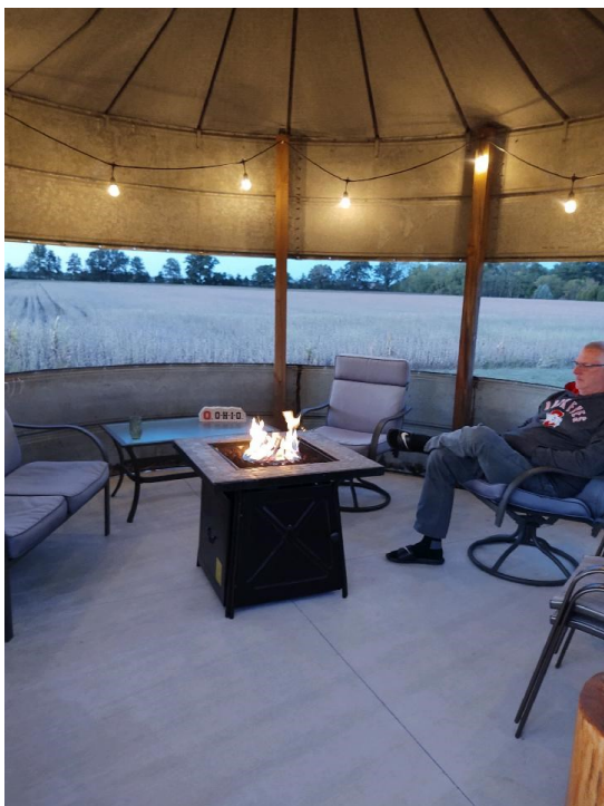
Relaxing in the grain-bin gazebo— “ga-bin-zo”