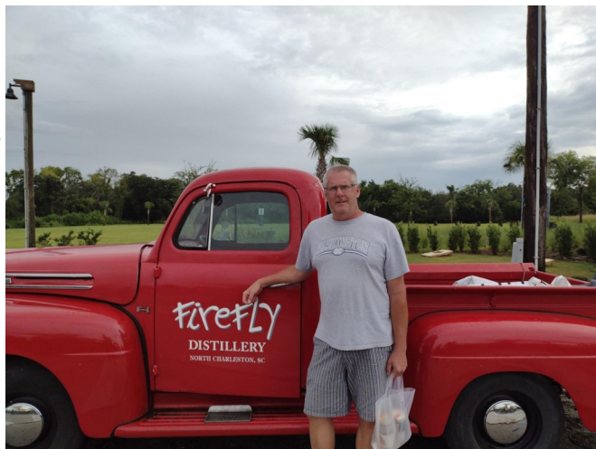
Firefly Distillery in North Charleston, South Carolina

Another favorite pass time of ours is relaxing in the backyard “ga-bin-zo” enjoying the peace and quiet. I also enjoy serving on the SWCD board and look forward to the future.