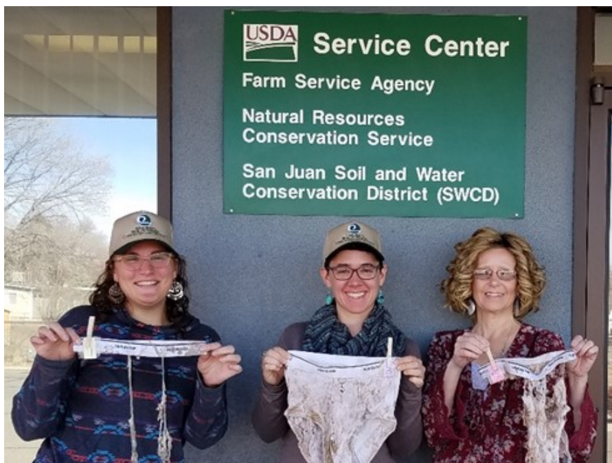
San Juan Conservation Services