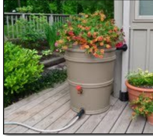
(plants not included) Granite